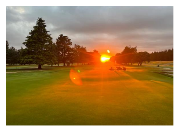
Sunrise on the course captured by our members