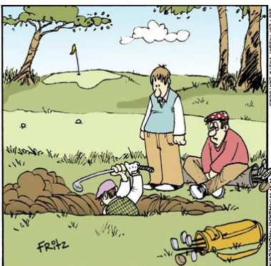
DAN TAKES YET ANOTHER PRACTICE SWING.