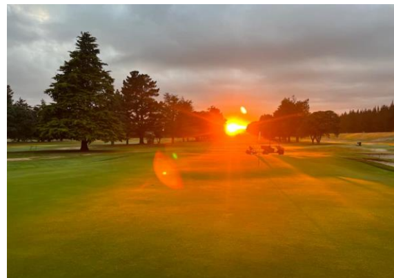
Sunrise on the course captured by our members