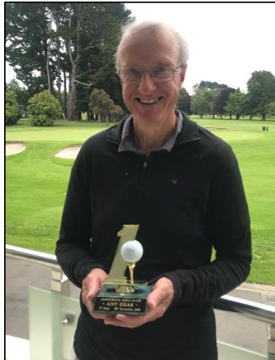
Ant Gear got a hole in one on the 4 th hole on 28 th November 2020