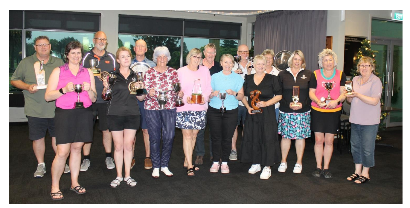
Above: 9-Hole Prizegiving Recipients 2023