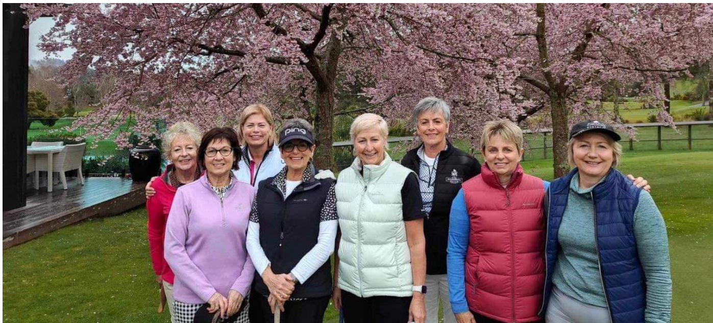
Below: Saturday girls at Wairakei.