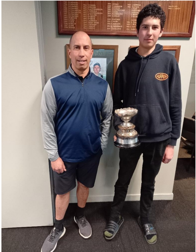
Manawatū Golf Club News September 2023 | Page 2 of 18

This Men's Pairs Cup is one of the most sort after club trophies, having been competed for since 1912. So well done in winning such a prestigious club trophy!