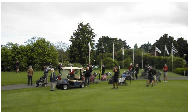
Shoot-out 2016 hole data

Those interested in entering next year's competition which starts from the 1 st Saturday after opening day can do so via paying $30 at the office. The Match committee will announce the playing conditions before next season but the requirement for 8 counting stableford scores will most likely continue.