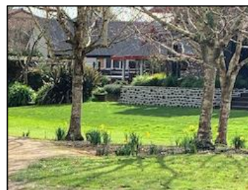
Only 4 weeks until spring!

Good Golfing, Jill Clifton - Ladies' Club Captain