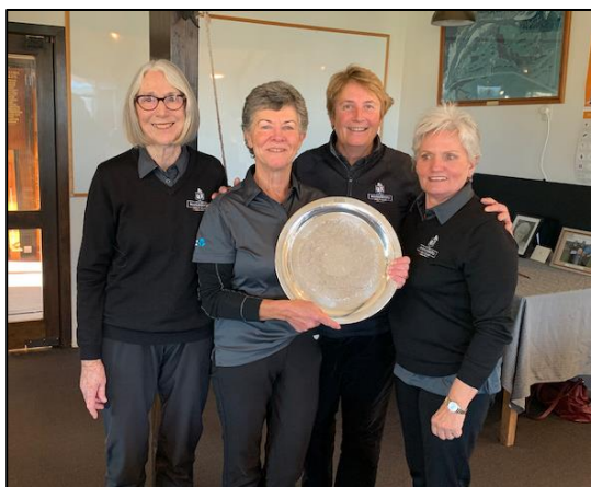
Silver Team on the final day

Both the ladies' Silver Pennant team and the District team managed to have wins on the final day of the pennant competition for 2021. Both teams were clear winners which means that all four of the Manawatu women's teams won their pennants. Quite an achievement for the ladies. Congratulations to all who played. The only problem now is to find a place for the trophies and pennants.