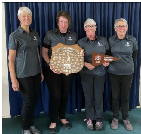
District Team on the final day